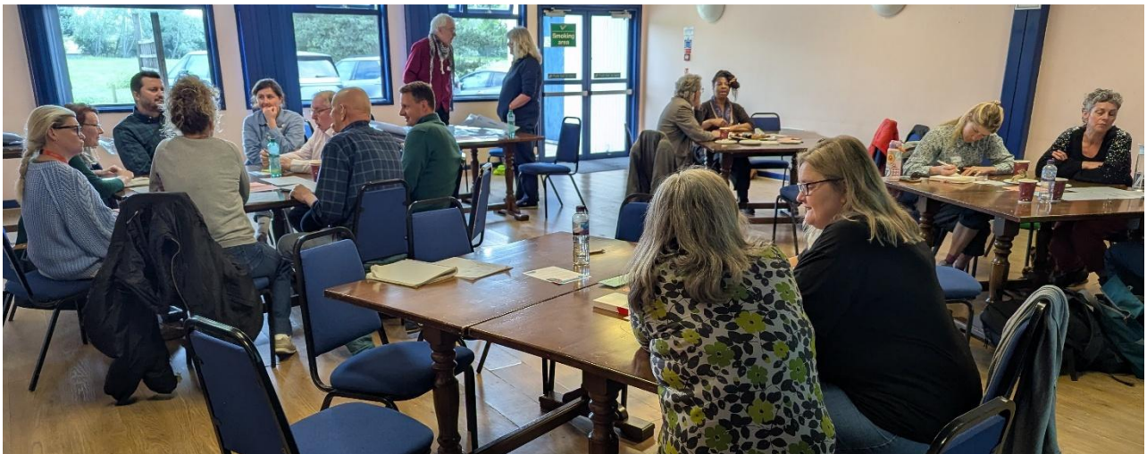
The Open Space session underway

Any other topics on the agenda either had no conversation, or no notes from the conversation.