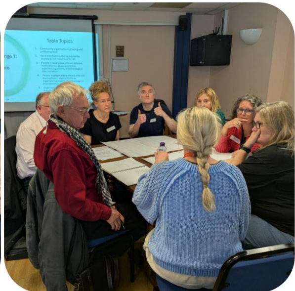
Where are we now? World café table topics